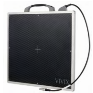
Designed and manufactured by Vieworks in Korea